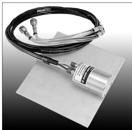
Sealed VW Settlement Cell